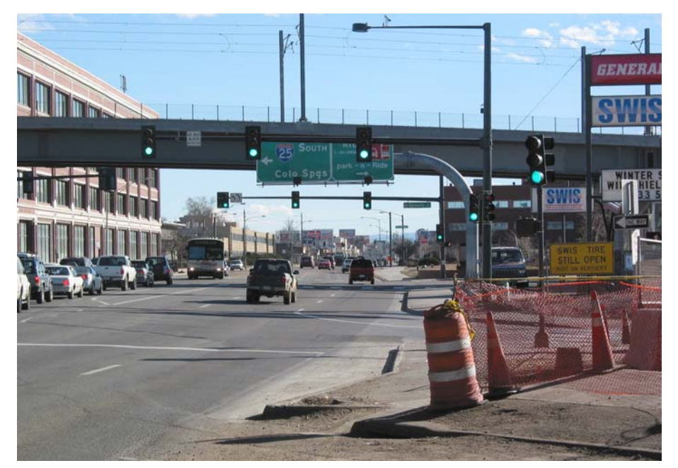
South Broadway System, South Denver