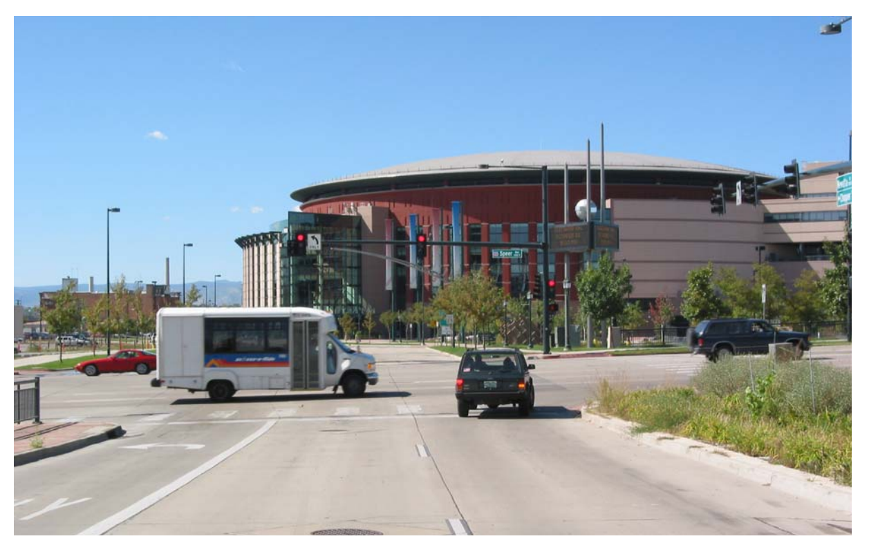
Pepsi Center System, Downtown Denver

Overview: Implementation studies, design, specification and implementation of over 30 new or enhanced centralized-hybrid and distributed traffic signal systems