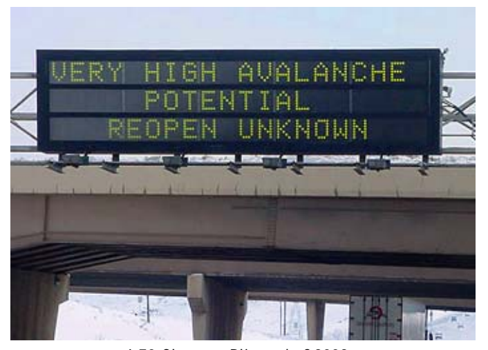
I-70 Closure "Blizzard of 2003"