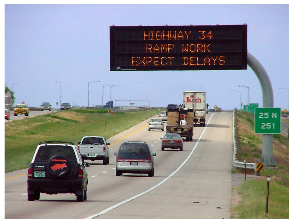
DMS on Northbound I-25

Overview: Implementation studies, design and specifications