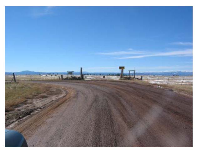
Drainage and Erosion Control Issues on Ridge Road